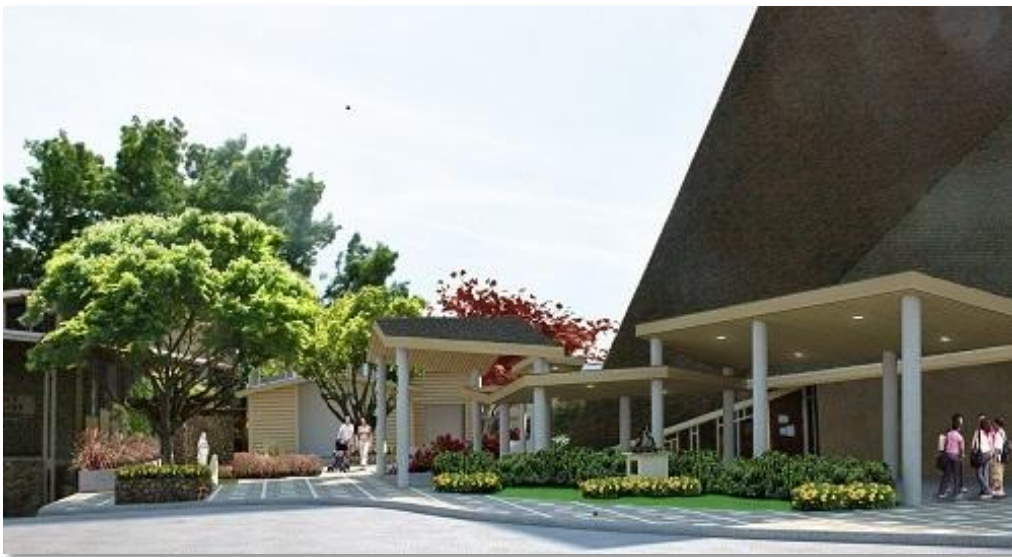
Patio plan includes new covering to provide protection from the rain in winter and shade in the summer, as well as new seating areas, beautiful landscaping and a brick terrazzo.